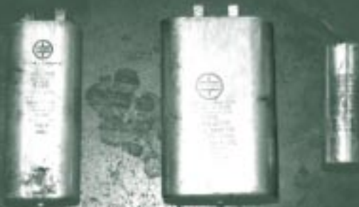
SEVERAL TYPES OF PCB CAPACITORS